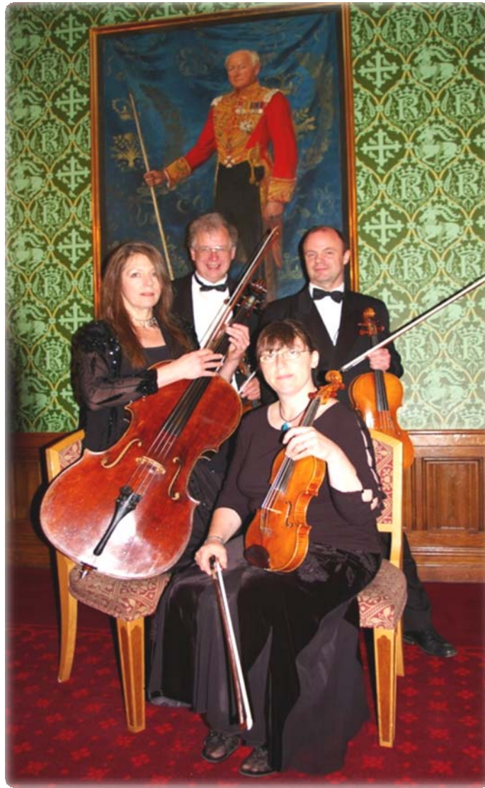
House of Lords, Cholmondeley Room